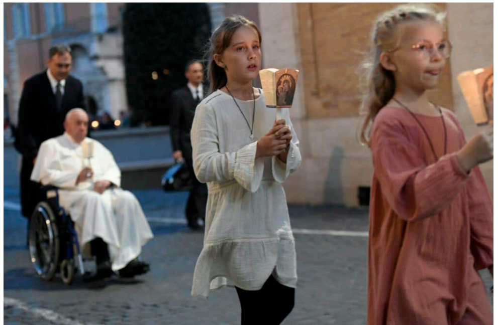
Pope Francis, led by candlebearers, at the Ecumenical Prayer Vigil in Protomartyrs Square.

Stating that “the journey of synodality is, and must be, ecumenical”, Pope Francis further expressed his hope that the ongoing Synod would