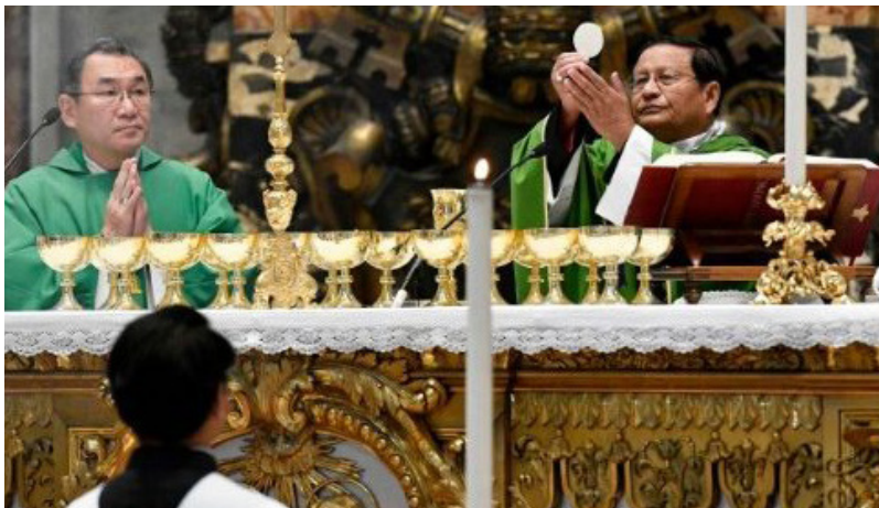
Cardinal Charles Maung Bo celebrating Mass in St Peter's Basilica

"Our Synodal journey," he went on to say, "is not a pre-programmed space odyssey with fixed mathematical equations. Rather, when God calls us, He becomes our guide, our roadmap, and our companion."